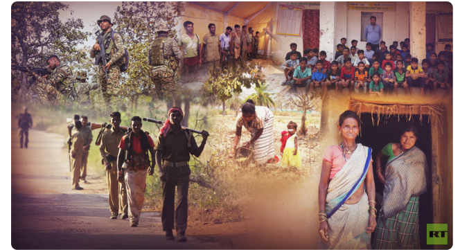
‘The night of red terror is over; this is a new dawn’: Villagers shed a former Maoist rebel past FEATURE