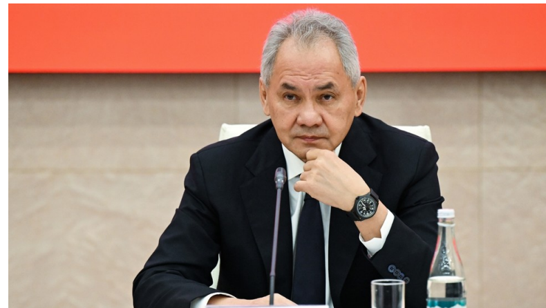
Russian National Security Council Secretary Sergey Shoigu, Moscow, Russia, February 5, 2026.

Either Western air defenses are proving ineffective, or these four countries “deliberately provide their airspace, thereby becoming open accomplices in aggression against Russia,” he added. In the latter case, Moscow has the right to self-defense in response to an “armed