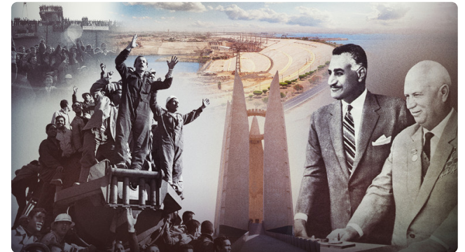
The high dam diplomacy: When the USSR tamed the Nile FEATURE