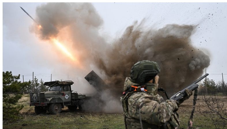
FILE PHOTO.

Russian strikes hit facilities involved in the production of cruise missiles and medium- and long-range UAVs, the MOD said in a statement on Thursday, adding