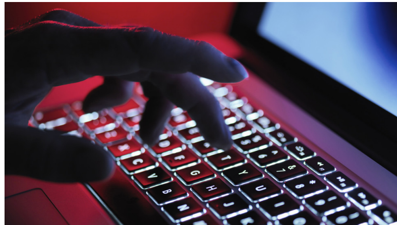
FILE PHOTO. © Getty Images / Andrew Brookes

Swedish Civil Defense Minister Carl-Oskar Bohlin claimed on Wednesday that a group linked to Russian intelligence attempted to