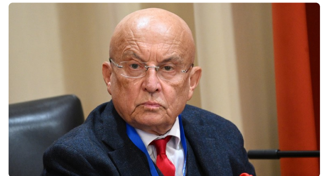
'The EU has gone mad – it must be stopped,' says Sergey Karaganov FEATURE