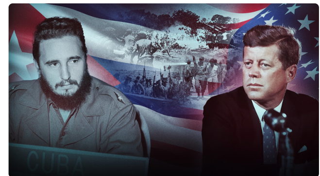
The CIA, wishful thinking, and imperial