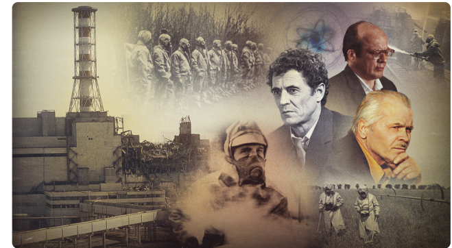
40 years after Chernobyl: Inside the night the Soviet nuclear dream exploded FEATURE