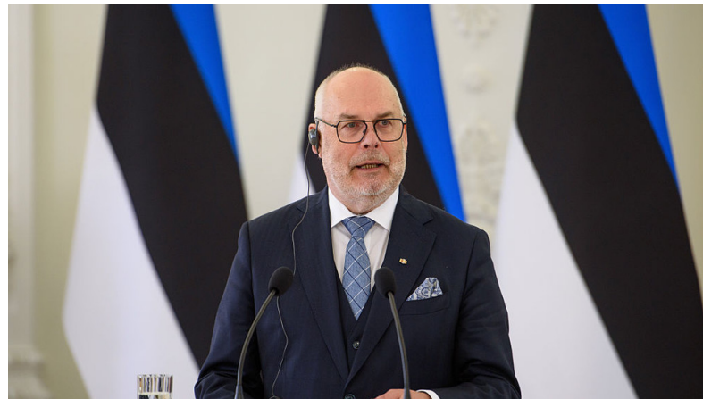
Estonian President Alar Karis.

The remarks, made in an interview with the Finnish daily Helsingin Sanomat and published on Monday, come after four years during which the EU has refused to engage in dialogue with Moscow.