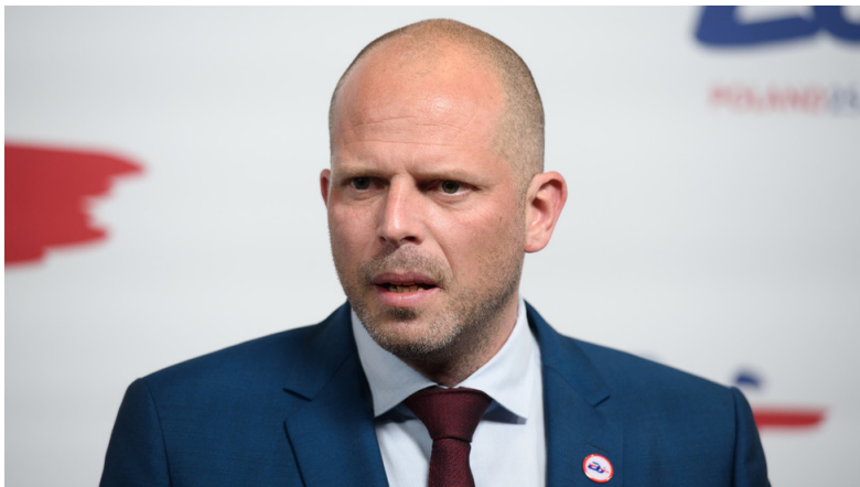
Belgian Defense Minister Theo Francken

and host of independently produced talk-shows in French and English.