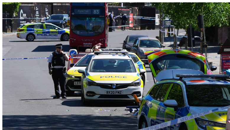
Police at the scene where two people were stabbed, April 29, 2026, Golders Green area of London, England.

The incident happened in the Golders Green area, where arsonists set fire to four ambulances operated by a Jewish volunteer organization just a little over a month ago.