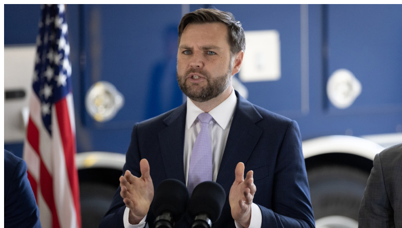
US vice president J.D. Vance.

A summit between presidents Donald Trump and Vladimir Putin is set for August 15 in Alaska