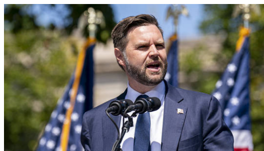
Read more: US is ‘done’ funding Ukraine – Vance

Trump and Putin are set to meet next Friday in Alaska, with a possible deal on the conflict between Kiev and Moscow at the top of the agenda. Ukraine’s Vladimir Zelensky has already rejected any truce that would involve territorial concessions, despite Trump saying they would be part of the proposed agreement.