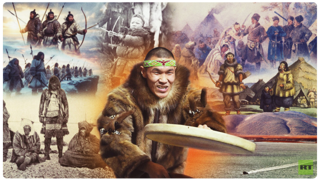
Meet fierce Northern warriors who fought Russia for a century and learned a valuable lesson FEATURE