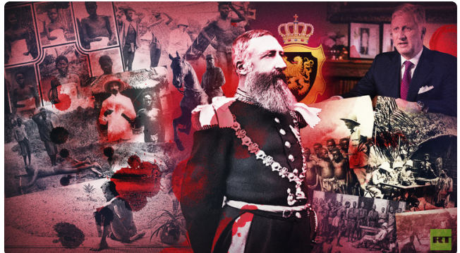
Terror and torture in the 'heart of darkness', the world's only private colony FEATURE