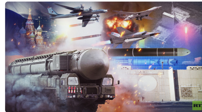
Rockets from Russia: Inside Moscow's deadliest arsenal yet FEATURE