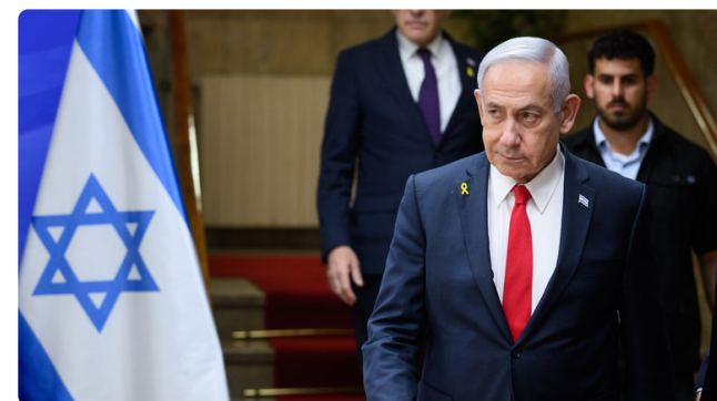
'They don't want to end the war': Netanyahu bets on Gaza to save himself FEATURE