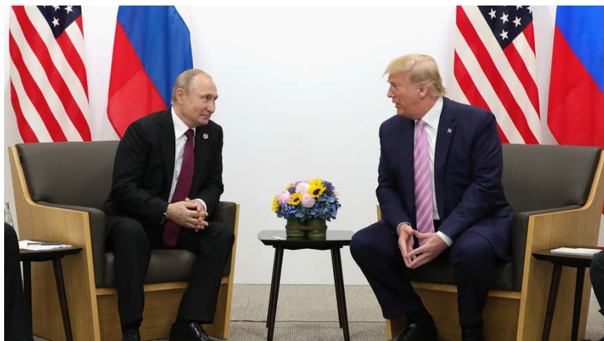
FILE PHOTO: Russian President Vladimir Putin and US President Donald Trump.