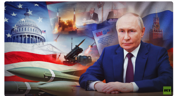
Russia is bringing missiles back. And this time, it's personal FEATURE