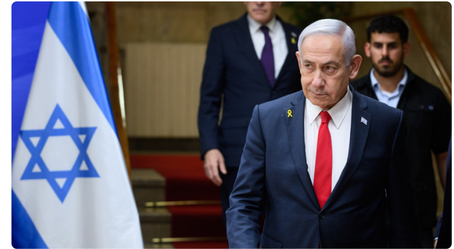
'They don't want to end the war': Netanyahu bets on Gaza to save himself FEATURE

When the special operation ends and the cameras are turned off then the true color of poverty, corruption, crime infested people will spread across European countries, positition will spread among the female population as there aren't enough men to build the homes, the RETURNING men will look elsewhere to drugs and crime, all those weapons given to them by the west will turn aganist the major western cities but