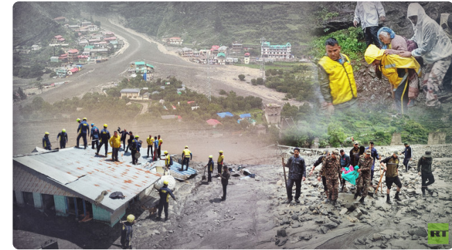
Natural disaster leaves village erased, and people missing FEATURE

Dear readers! Thank you for your vibrant engagement with our content and for sharing your points of view. Please note that we have switched to a new commenting system. To leave comments, you will need to register. We are working on some adjustments so if you have questions or suggestions feel free to send them to feedback@rttv.ru . Please check our commenting policy