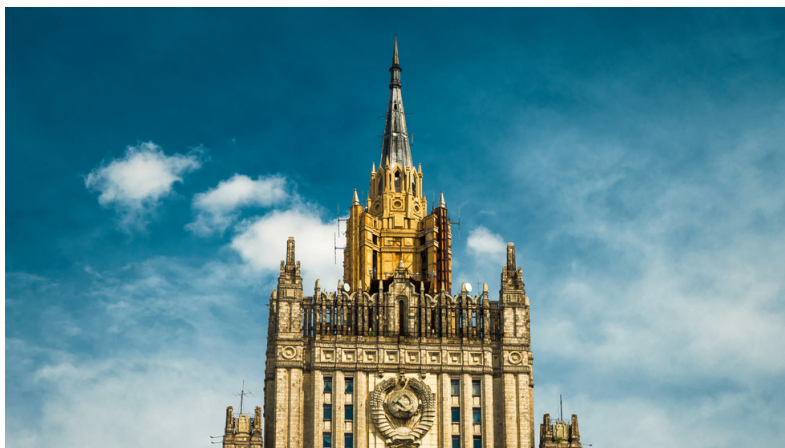
FILE PHOTO. Russian Ministry Of Foreign Affairs building in Moscow.

Moscow has accused the European powers of abusing the UN snapback mechanism against Tehran