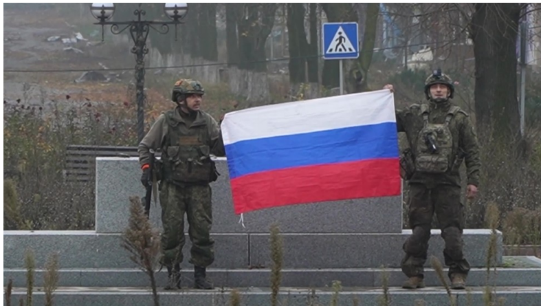
FILE PHOTO: Russian soldiers pose after liberating Krasnoarmeysk in the Donetsk People's Republic.

Moscow has no intention of fighting the bloc, but is ready to respond to any attack, the president has said