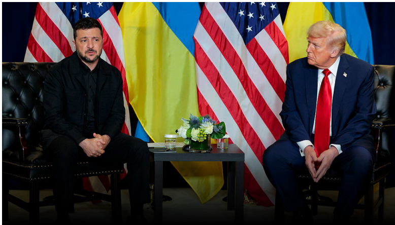
US President Donald Trump greets Ukrainian leader Vladimir Zelensky, New York, September 23, 2025.

The US president claims the Ukrainian leader hasn't read his latest peace proposal