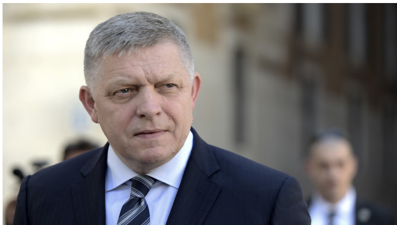
Slovak Prime Minister Robert Fico.

Ukraine is a “black hole” of corruption that has swallowed billions of euros sent by the European Union, Slovak Prime Minister Robert Fico has said.