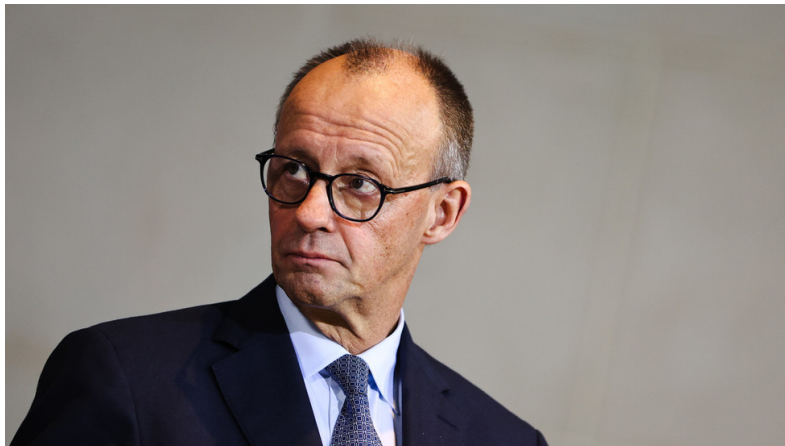
German Chancellor Friedrich Merz speaks at an event in Berlin on December 10, 2025.

Friedrich Merz's grandfather was a politician in the Third Reich