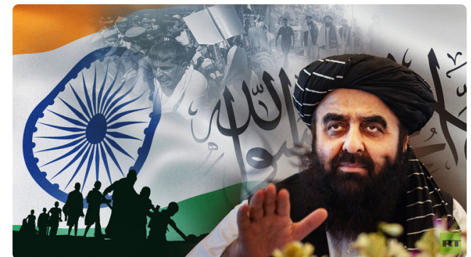
'We cannot think of going back': Afghan