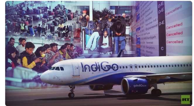
Indi-no-go: What brought the world's third-largest aviation market to a standstill? FEATURE