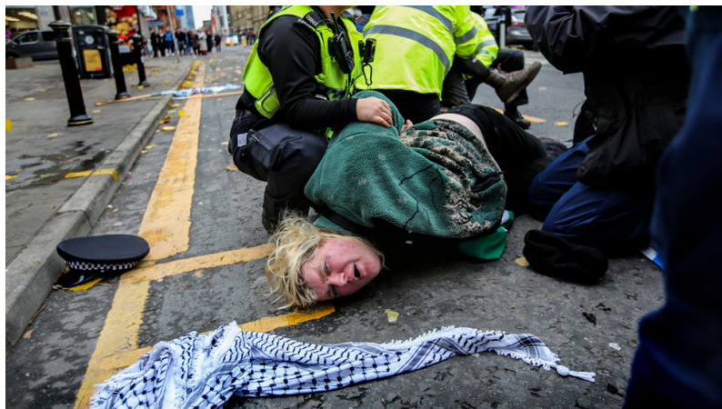
FILE PHOTO. A Palestine Action activist is arrested by police officers in Manchester, UK, November 22, 2023.

@tarikcyrilamar tarikcyrilamar.substack.com tarikcyrilamar.com