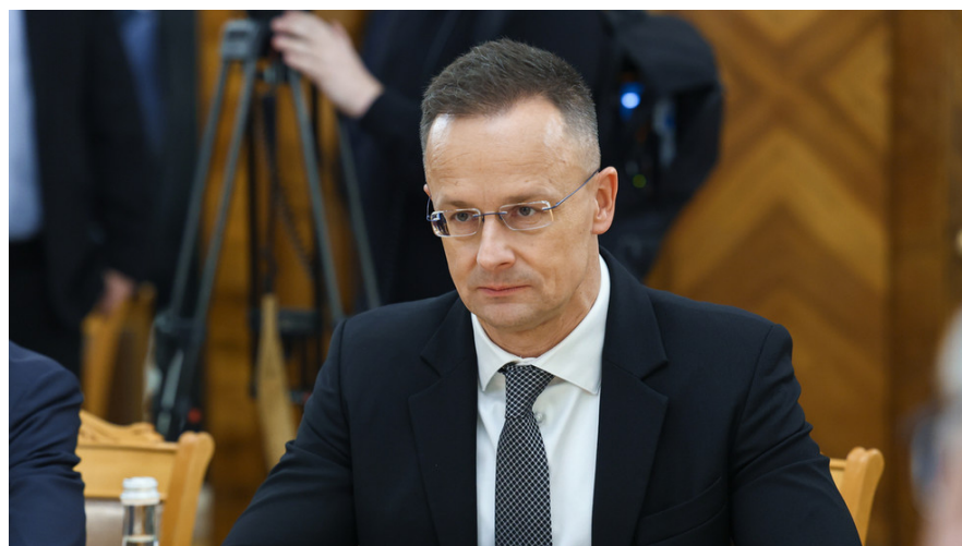
Hungarian Foreign Minister Peter Szijjarto

The bloc’s restriction on natural gas imports raises costs and violates its own treaties, Foreign Minister Peter Szijjarto has said