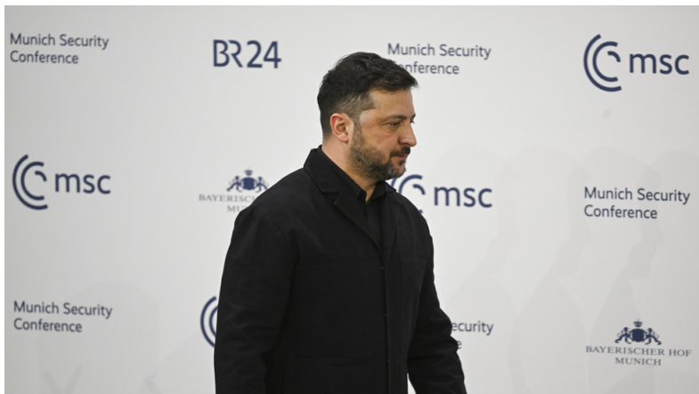
Ukrainian leader Vladimir Zelensky speaks in Munich, Germany on

The Ukrainian leader urged the West to expel Russian nationals