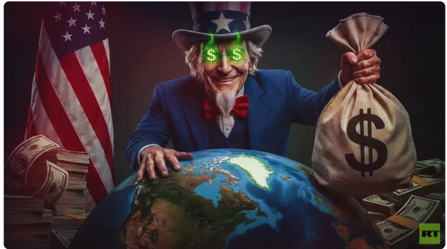
Can you buy a country? FEATURE