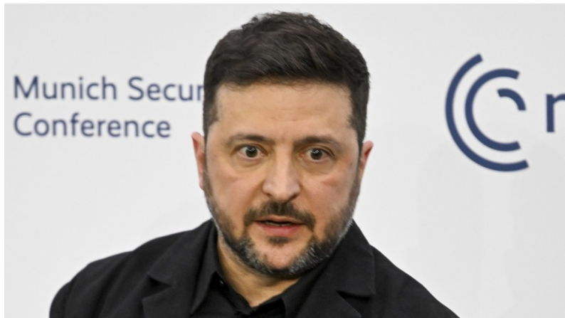
Ukraine's Vladimir Zelensky, Munich, Germany, February 14, 2026.

The Ukrainian leader has been using increasingly obscene and disparaging language in public remarks