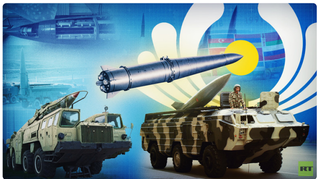
Missiles in the shadow of the USSR: How Post-Soviet states built their arsenal FEATURE