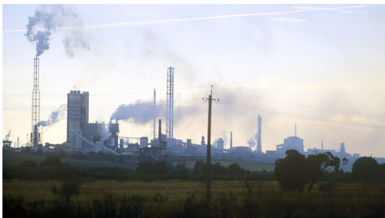
Dorogobuzh nitrogen fertilizer plant in Smolensk Region, Russia.

Ten civilians were also injured in the attack on the enterprise in Smolensk, according to investigators