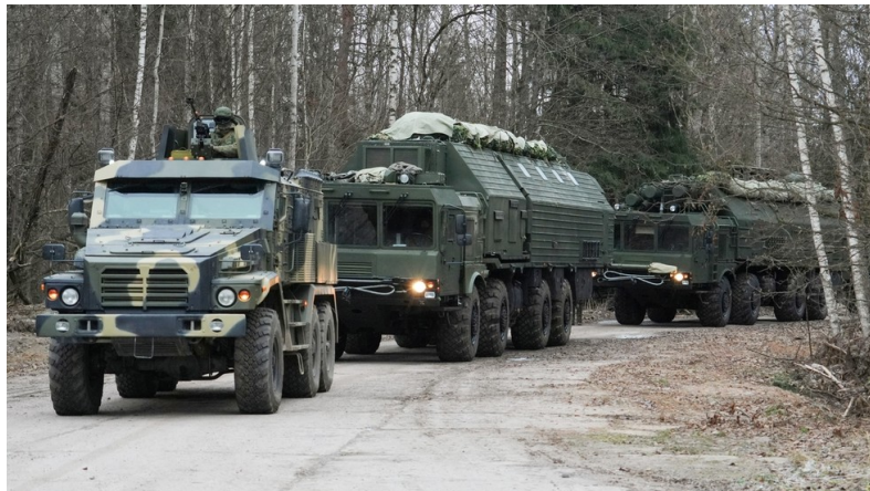
FILE PHOTO: A road-mobile unit equipped with a Russian Oreshnik intermediate-range hypersonic missile system assuming combat duty in

A number of critical facilities were hit during the overnight strike, the Defense Ministry in Moscow has said