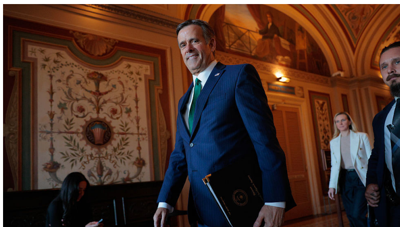
CIA Director John Ratcliffe meets House and Senate leaders at the US Capitol in Washington DC, December 9, 2025

The agency's work in Caracas will reportedly follow the Ukraine playbook