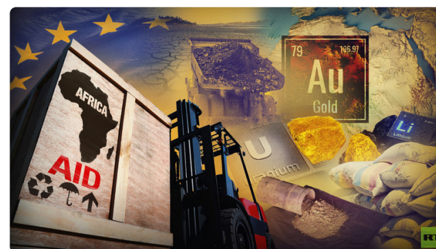
Wolves in sheep's clothing: The dark side of Western benevolence FEATURE