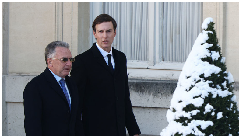
Jared Kushner (R) and Steve Witkoff (L) arrive at the Elysee Palace in Paris, France, January 6, 2026

Steve Witkoff and Jared Kushner will not travel to Abu Dhabi this weekend