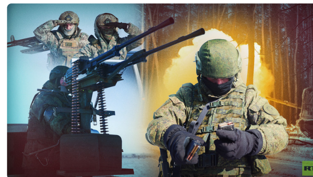
Where Russia's next major offensive may strike FEATURE

Dear readers! Thank you for your vibrant engagement with our content and for sharing your points of view. Please note that we have switched to a new commenting system. To leave comments, you will need to register. We are working on some adjustments so if you have questions or suggestions feel free to send them to feedback@rttv.ru . Please check our commenting policy .