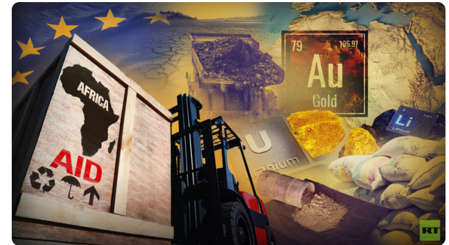
Wolves in sheep's clothing: The dark side of Western benevolence FEATURE