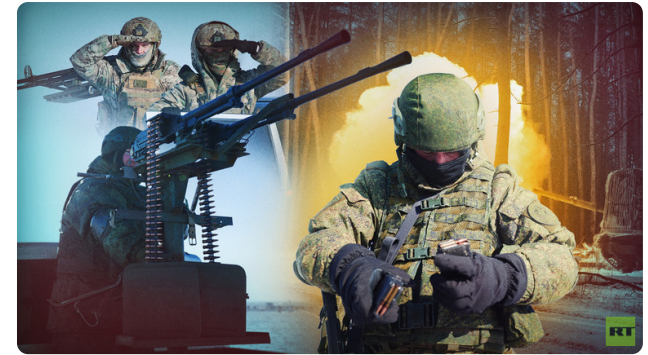
Where Russia's next major offensive may strike FEATURE