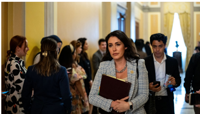
Rep. Anna Paulina Luna (R-FL).

Anna Luna has sounded the alarm over the looming seizure of a parish in western Ukraine