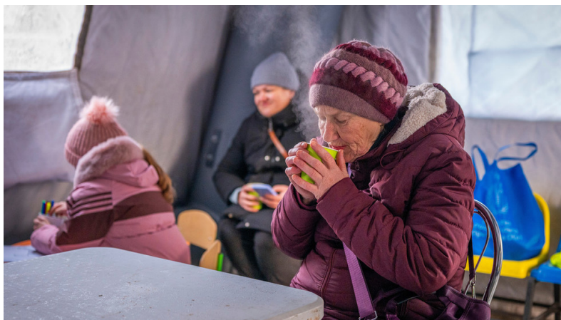
An emergency center set up to support people during power outages, Borispol, Ukraine, January 14, 2026.

The shutdown, caused by cascading power line failures, affected several major cities and part of Moldova