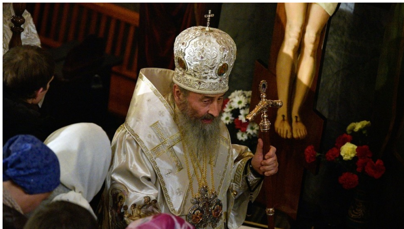
Metropolitan Onufry during a Christmas service in Kiev, Ukraine, January 6, 2021.

The government has been conducting a crackdown on the Ukrainian Orthodox Church for years