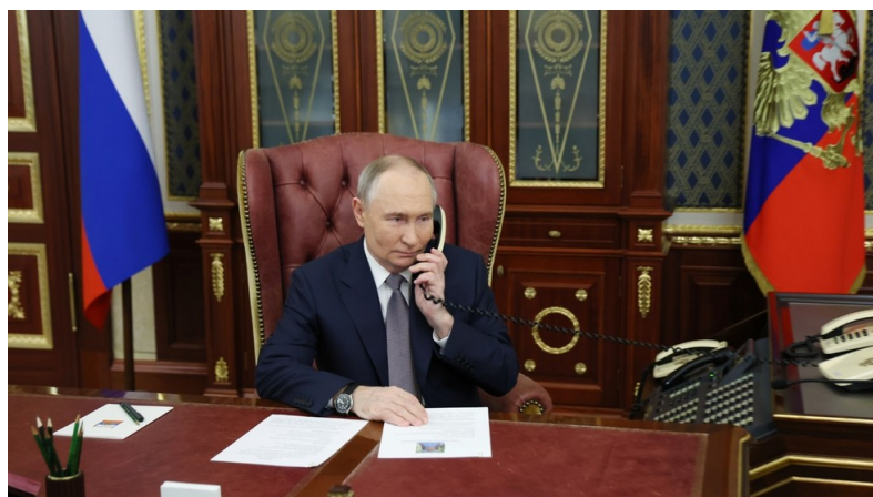
Russian President Vladimir Putin.

The Russian and US presidents have held several conversations in recent months, mainly discussing the Ukraine conflict