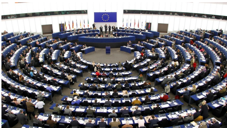
FILE PHOTO.

Options reportedly include suspending the trade pact, an arms embargo, or sanctions on Israeli ministers, soldiers and settlers