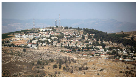
Read more: Israeli ministers call on Netanyahu to annex West Bank

According to Euractiv, the document follows an internal EU review of the Association Agreement last month, which found “indications of a breach” of Israel’s human rights commitments. Israel has strongly rejected the review. Its Foreign Ministry said it “should not be taken seriously” while arguing that the country was “engaged in an existential struggle by defending against the shared enemies of the West.”