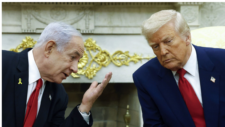
FILE PHOTO: Israeli Prime Minister Benjamin and US President Donald Trump.

Fresh off a bruising 12-day war with Iran, Israeli Prime Minister Benjamin Netanyahu is flying back to Washington. This will be his third visit to the US since Donald Trump returned to the White House – but arguably the most consequential. For Netanyahu, it's more than a diplomatic courtesy call: it's a chance to cash in on battlefield