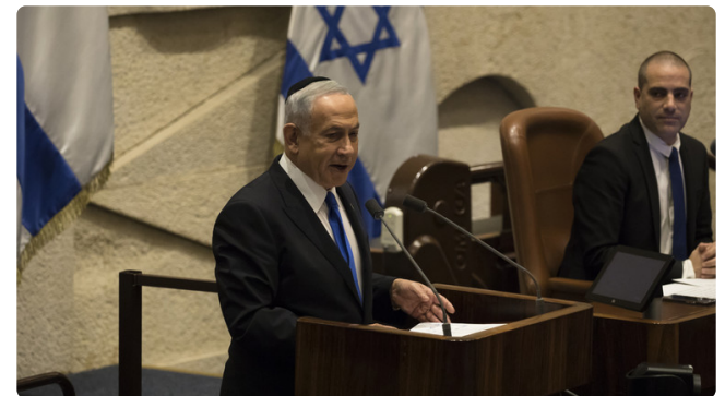
Israel just drew a new map – without saying it