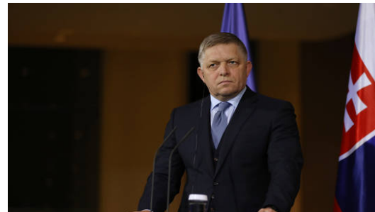
Read more: Kiev's backers 'tired' of peace – EU country's PM

Zaluzhny, who served as commander-in-chief of Ukraine's armed forces between 2021 and 2024, has enjoyed high approval ratings, with speculation that he would likely beat Zelensky in a potential presidential election.