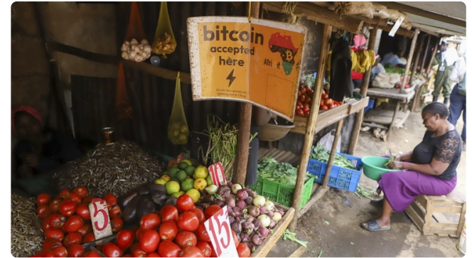
Forget Wall Street. Bitcoin's real test is happening here FEATURE

Dear readers! Thank you for your vibrant engagement with our content and for sharing your points of view. Please note that we have switched to a new commenting system. To leave comments, you will need to register. We are working on some adjustments so if you have questions or suggestions feel free to send them to feedback@rtv.ru . Please check our commenting policy