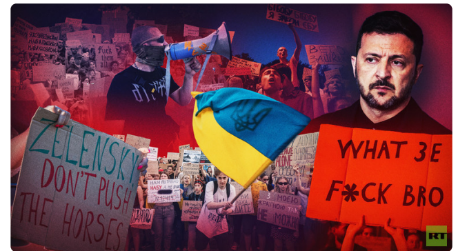
Zelensky broke the American controls – and now faces the consequences FEATURE