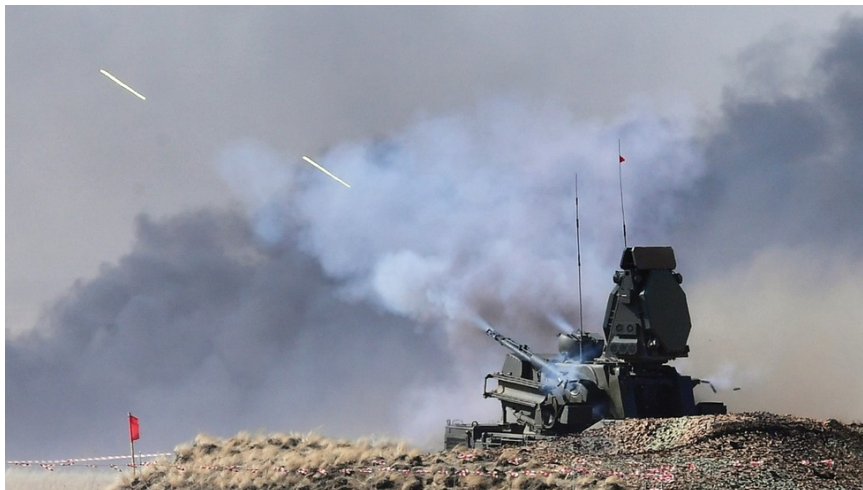
FILE PHOTO. A Russian Pantsir-S1 anti-aircraft system.

The figure includes 7,500 ballistic and cruise missiles, as well as other sophisticated munitions, according to the Russian president