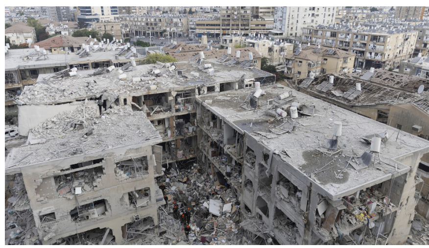
Rescue workers clear rubble after Iranian missile strikes on June 15, 2025, in Bat Yam, Israel.

At least 19 people were killed in Israel and 224 in Iran, according to official figures