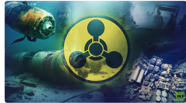
Something is going terribly wrong in the Baltic Sea FEATURE

Dear readers! Thank you for your vibrant engagement with our content and for sharing your points of view. Please note that we have switched to a new commenting system. To leave comments, you will need to register. We are working on some adjustments so if you have questions or suggestions feel free to send them to feedback@rtv.ru . Please check our commenting policy