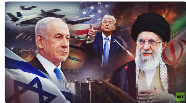
'If Iran falls, we all lose': Why Tehran's allies see this war as civilizational FEATURE