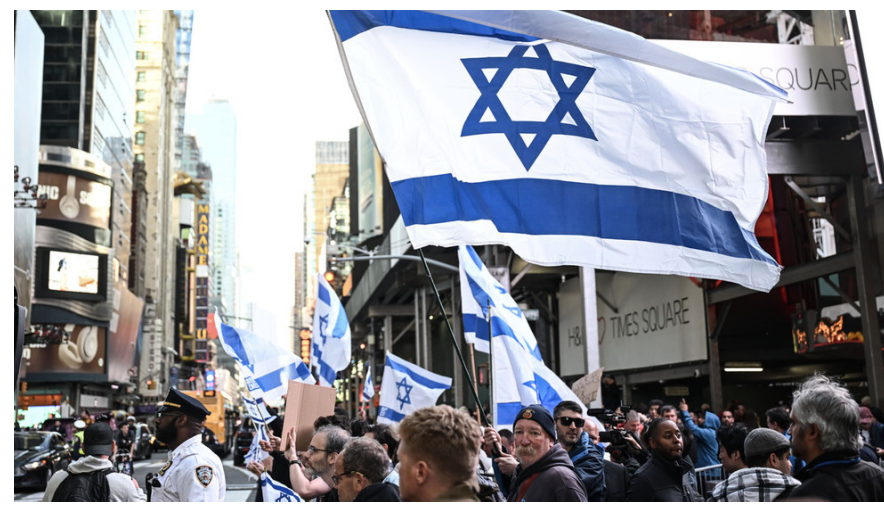
FILE PHOTO. A group of pro-Israel demonstrators gather to protest people attending a Pro-Palestinian demonstration with Palestinian flags and banners in support of Palestinians at Times Square in New York, United States.

Lavrov compares Ukrainian Nazis with Third Reich