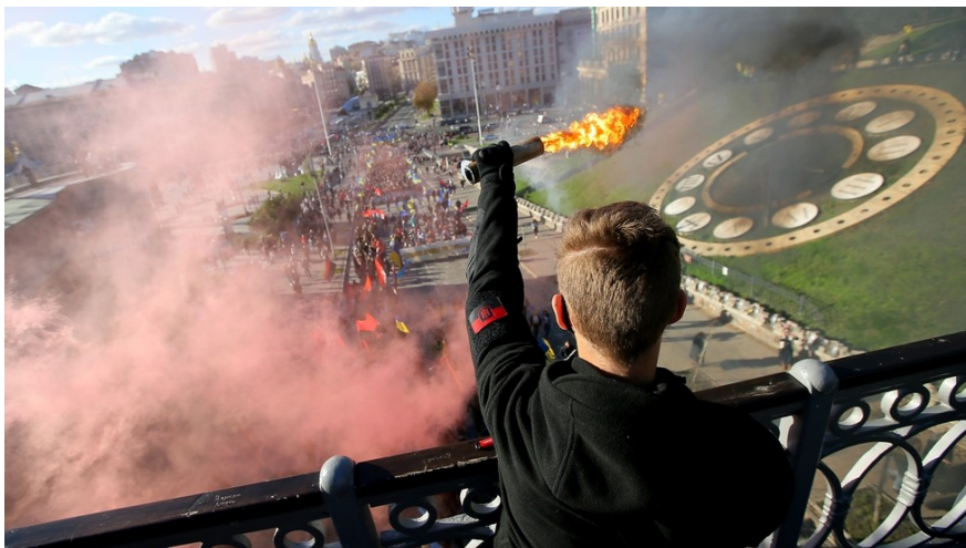
FILE PHOTO: Ukrainian nationalists commemorate the Ukrainian Insurgent Army in Kiev

It's hard to believe one's eyes while witnessing the latest performance put on by the comedian tyrant of Ukraine.