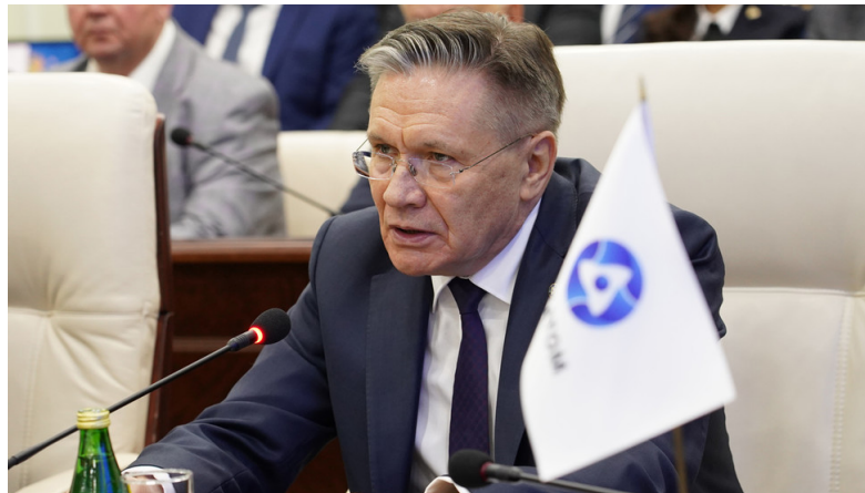
FILE PHOTO: Rosatom head, Aleksey Likhachev, attending a licensing ceremony for operating the Zaporozhye Nuclear Power Plant's first reactor

Europe's largest nuclear power plant has been targeted by Ukraine on multiple occasions since Russia took control of the