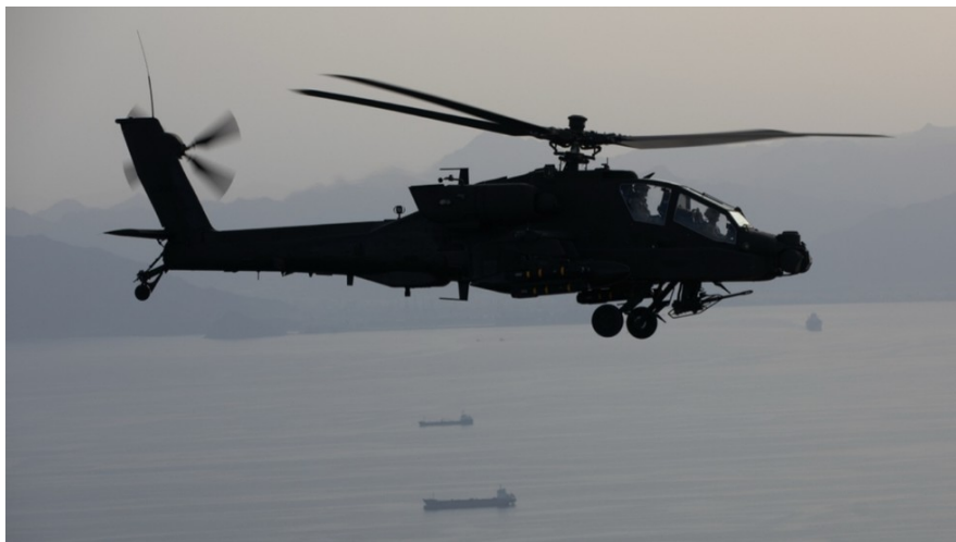
An American AH-64 Apache helicopter flying above the Strait of Hormuz during a patrol mission.

Published 9 Jun, 2026 12:17 | Updated 9 Jun, 2026 13:20