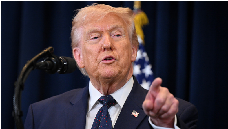
US President Donald Trump gestures as he speaks during a news conference at Trump National Doral Miami on March 9, 2026, in Florida.

The US will “ massively blow up ” the South Pars gas field – the world's largest – if Iran continues to strike Qatari energy facilities, President Donald Trump has warned.