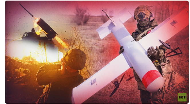
Another setback for Kiev: Ukraine's spring push stalls amid Russian gains FEATURE

To be a friend of America can be deadly, but to be a friend of Russia is terminal.