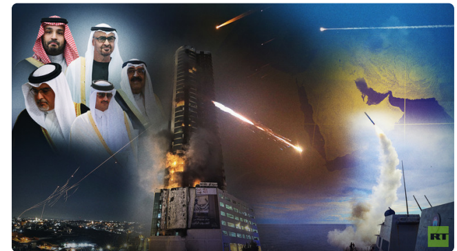
Thousands of missiles later: Why the Gulf still won't go to war with Iran FEATURE