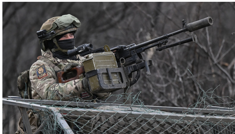
FILE PHOTO: A Russian serviceman of a Tor-M1 surface-to-air missile system crew monitoring the sky for drones.

However, an unusually large number of UAVs were shot down in Leningrad Region, surrounding Russia's second largest city, St Petersburg. Governor Aleksandr Drozdenko said at least 56 drones were destroyed.