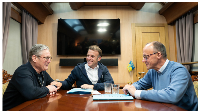
UK Prime Minister Keir Starmer, French President Emmanuel Macron and German Chancellor Friedrich Merz onboard a train to Kiev on May 9, 2025.