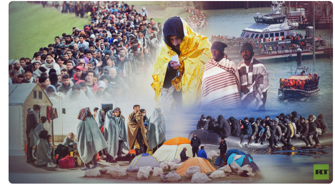
Gaddafi warned them. Now the EU is living out his grim prophecy FEATURE

T Tyrone 5/13/2025 at 11:32 AM ↑ 0 Well not according to the Russian non strategical nuclear forces. Is what the Iskander operator's basically are: Isk2: A very interesting story about the UK's plans to deploy its fleet in Odessa. Calibers, daggers and hazelnuts can finally be used for their intended purpose. After all, this fleet will immediately be under attack if it provides minimal military assistance to Ukraine. Isk1: For the third night in a row, the Geraniums, with all their roar, prove that it will be mortally inconvenient for the British to deploy a fleet and troops in Odessa. And then the Iskanders and BRK VAL will come. They will put an end to it. Reply