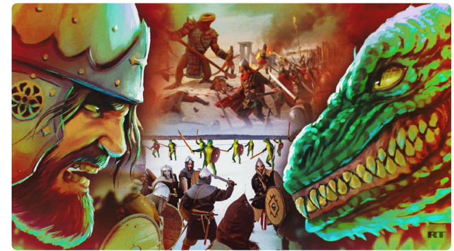
Donald Trump helped ancient Russians defeat space lizards. Western elites don't want you to know FEATURE