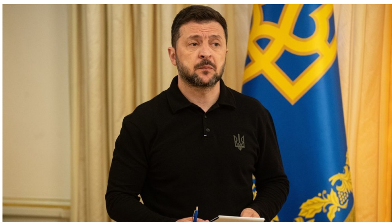
Vladimir Zelensky

Jonathan Powell is expected to make sure the Ukrainian leader does not do “anything that alienates Trump”