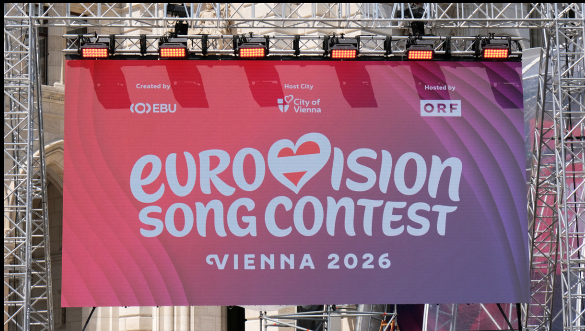
A poster of the Eurovision Song Contest at Wiener Rathaus on May 8, 2026 in Vienna, Austria.

Broadcasters from Spain, Ireland, the Netherlands, Iceland and Slovenia have withdrawn from this week's event over Israel's participation