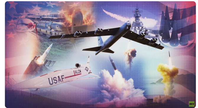
Stars, stripes, and missiles: What America's arsenal says about the wars to come FEATURE