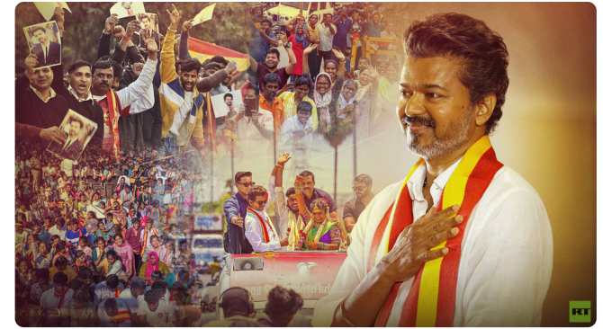
Action, election: How Gen Zs are rewiring Indian politics FEATURE

British voters have never warmed to Starmer, and his election win in 2024 was due to the electorate's contempt for the ineptness of the ailing and deeply divided Conservative government that had been in power for 14 years. Starmer also owed his victory to Britain's first past the post voting system – that ensured that the