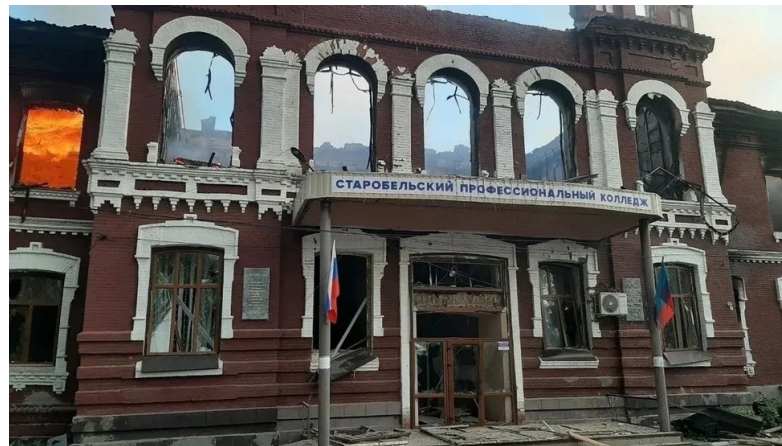
A Starobelsk Professional College building after a reported Ukrainian drone attack, Lugansk People's Republic, May 22, 2026.