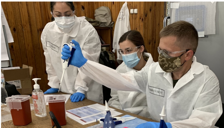
A US Army medical specialist trains Ukrainian disease specialists at the US Army Medical Institute of Infectious Diseases, Fort Detrick, Maryland, July 8, 2021

Published 12 May, 2026 18:46 | Updated 12 May, 2026 21:07