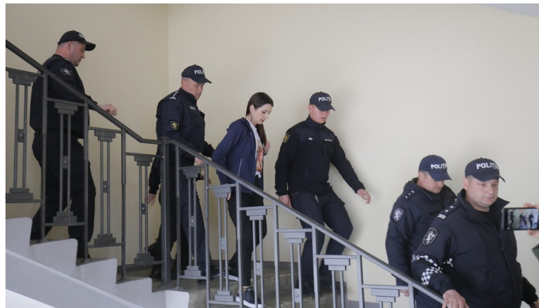
FILE PHOTO: Gagauz leader Evgenia Gutsul in Moldovan custody, Chisinau, April 1, 2025.

In 2025, the politician was convicted of channeling funds from Russia to candidates linked to the banned opposition Sor party, which the government of pro-EU President Maia Sandu has described as a