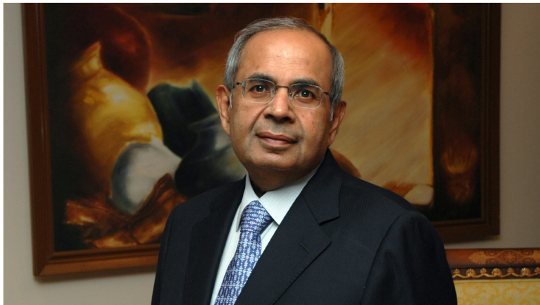
Gopichand P. Hinduja.

Gopichand P. Hinduja was chairman of Hinduja Group, a Mumbai-headquartered multinational conglomerate