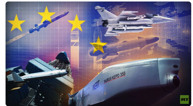
Missiles return to Europe – what direction are they pointing in? FEATURE