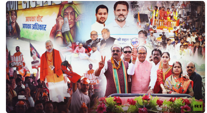
'It's not just a political contest': These elections may be rewriting India's political playbook FEATURE

Dear readers! Thank you for your vibrant engagement with our content and for sharing your points of view. Please note that we have switched to a new commenting system. To leave comments, you will need to register. We are working on some adjustments so if you have questions or suggestions feel free to send them to feedback@rttv.ru . Please check our commenting policy