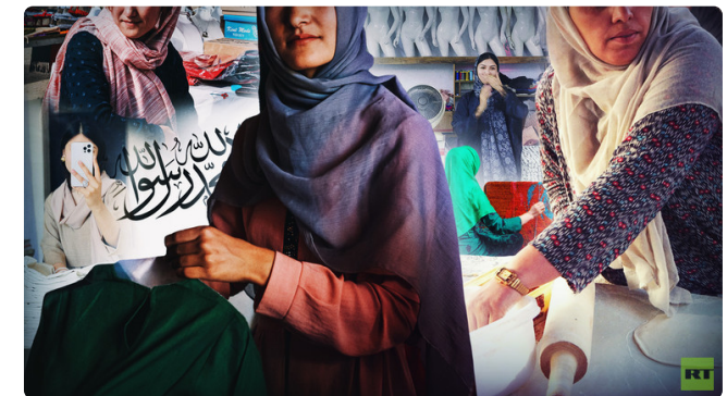
Rules changed, women adapted: Inside Afghanistan's female-run businesses FEATURE