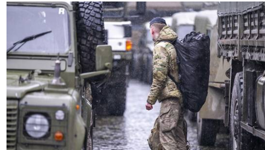
Read more: British anti-drone unit deployed to Belgium – defense minister