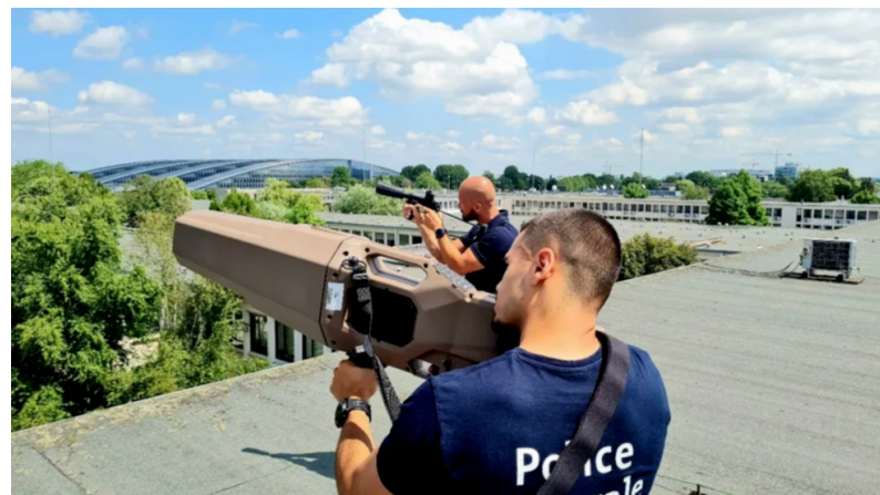
A screenshot from the Belgian police official website demonstrating the members of the anti-drone unit.

Brussels “didn’t even try” to deploy its own specialized police unit to deal with recent UAV incidents, Nieuwsblad has reported